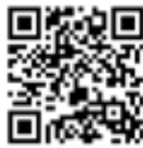
Frequently Asked Questions

If you have questions that are not answered here, please visit Mid-America Pediatric Environmental Health Specialty Unit (MAPEHSU) Children's Mercy Kansas City webpage at cmkc.link/MAPEHSU for further guidance. If you cannot find answers to your questions online, call our PEHSU hotline at (800) 421-9916 or email us at mapehsu@cmh.edu .